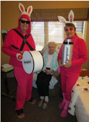
A couple of Energizer Bunnies visited us on Halloween