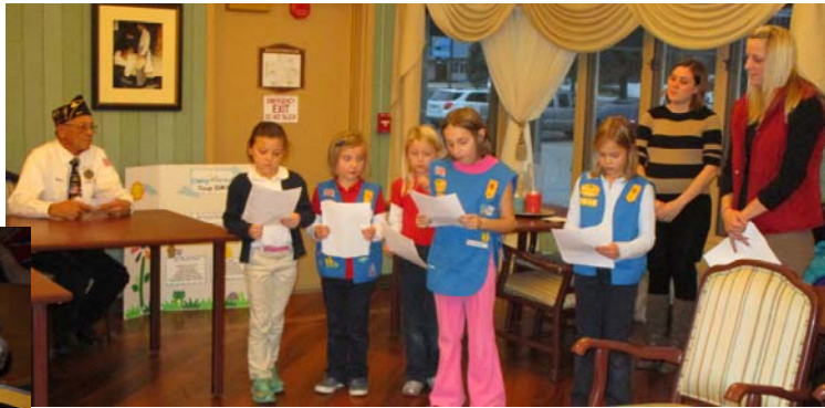
Thank you to the Daisy Troop from St. Jude's for putting on a very nice Veteran's Day program for us!