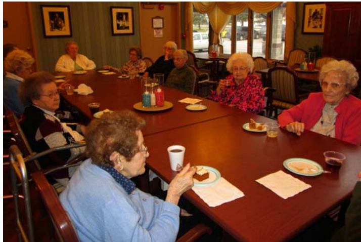
◀ There was a great turnout for our Giving Thanks Party! It was nice to hear all of the things that people are thankful for.